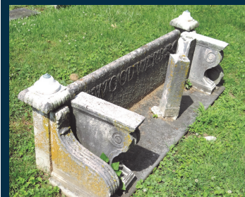
Before & After Restoration— Woodward bench— Section G