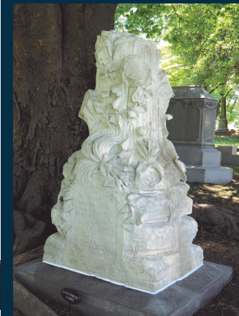
Speed family monument— Section N—After Restoration