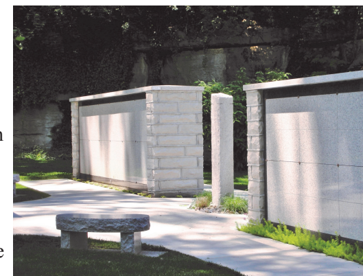
View of niche walls at Chapel Columbarium.

Ingram Construction Co., from Madison, Mississippi, was our contractor and are experts at building