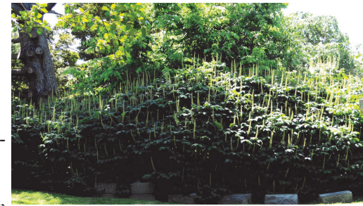
Bottlebrush Buckeye in Section O.